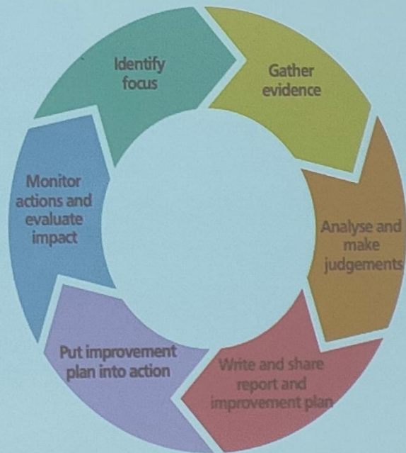
Figure 2.1: THE SIX-STEP SCHOOL SELF-EVALUATION PROCESS

Exploring Shaped Professional Learning Networks in Challenging Times